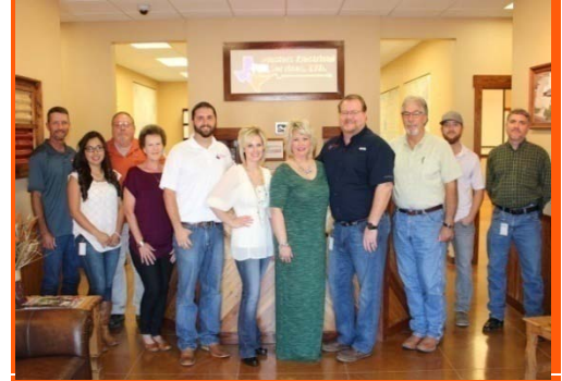
TOGETHER EVERYONE ACHIEVES MORE!