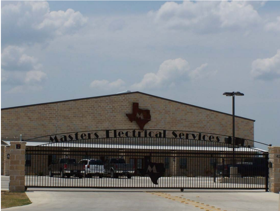
MASTERS ELECTRICAL SERVICES LTD. 4239 W. IH-10 :: SEGUIN, TEXAS 78155